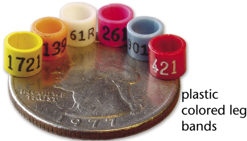
plastic colored leg bands

See http://purplemartin.org/update/BandingPM11(3).pdf for information on banding Purple Martins.