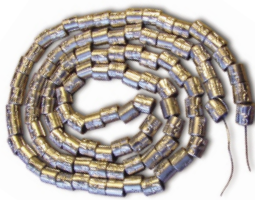
USFWS aluminum bands