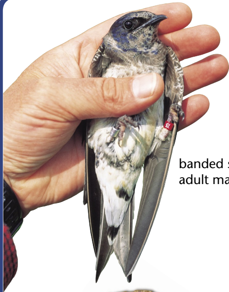
banded sub-adult male